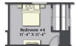
Opt. Bedroom #4 ILO Loft