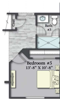
Opt. Bedroom #5 ILO Flex